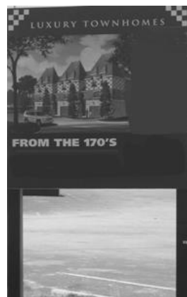
Off-Premise Real Estate