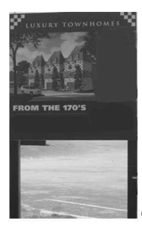
Off-Premise Real Estate